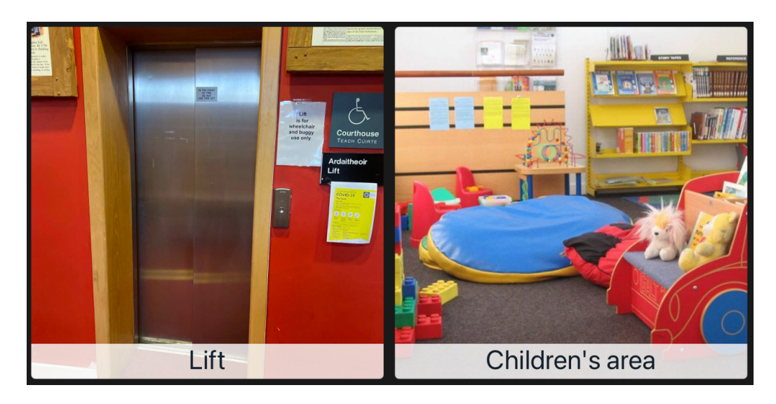
Come upstairs or take the lift up to our beautiful children's area.