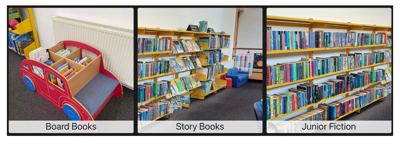
We have a lovely selection of Board Books, Picture Books, Story Books and Junior Fiction. We also have an excellent range of non-fiction books if you want to learn more facts.